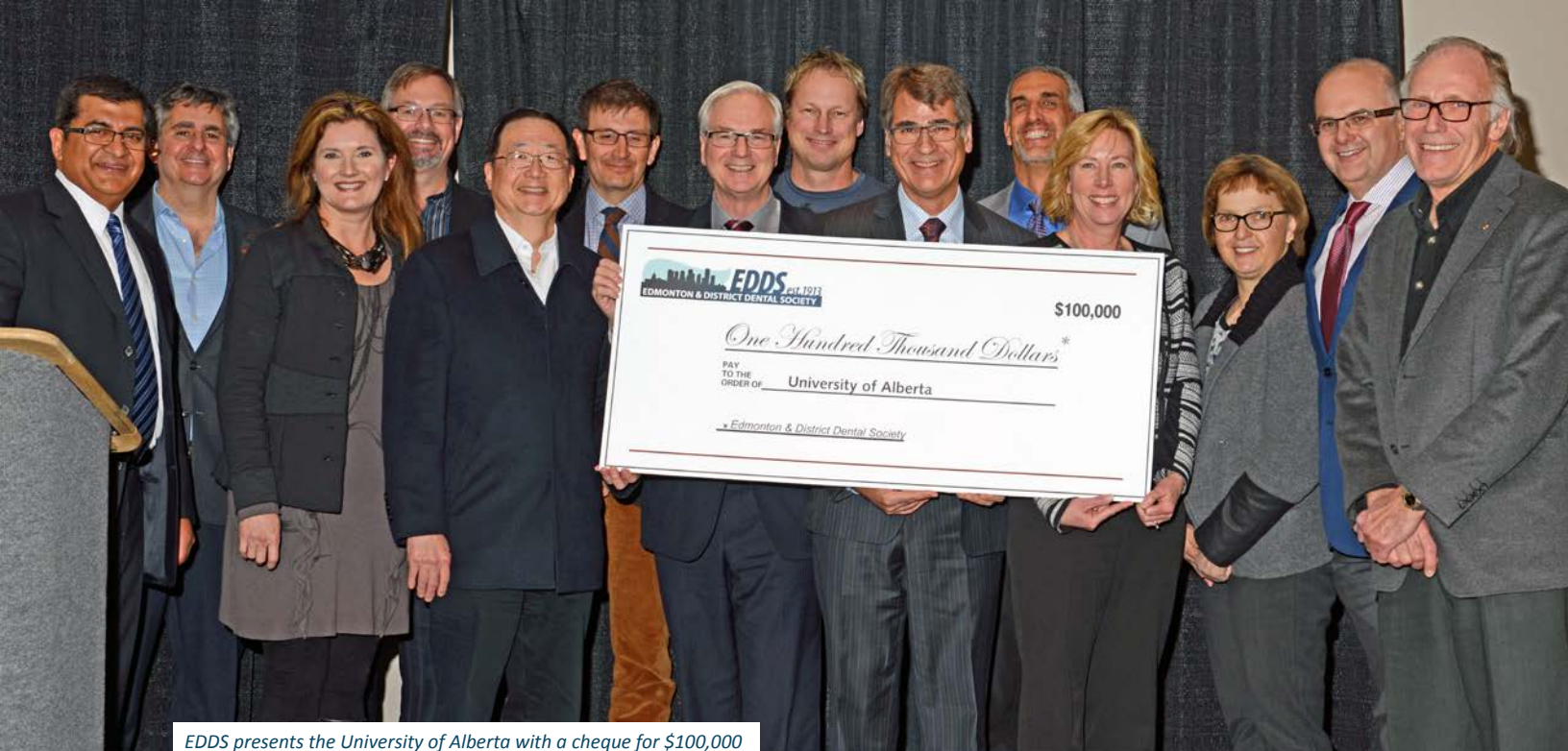
EDDS presents the University of Alberta with a cheque for $100,000